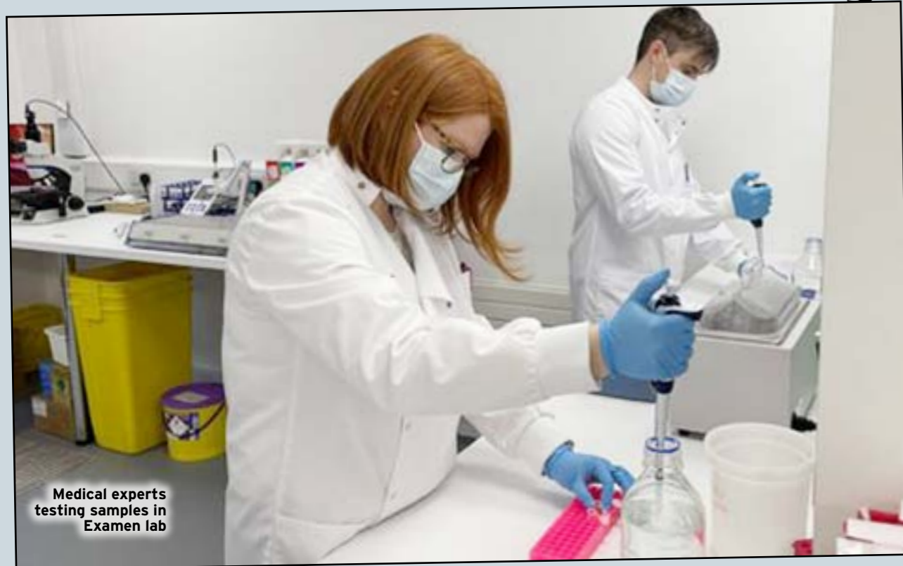
Medical experts testing samples in Examen lab