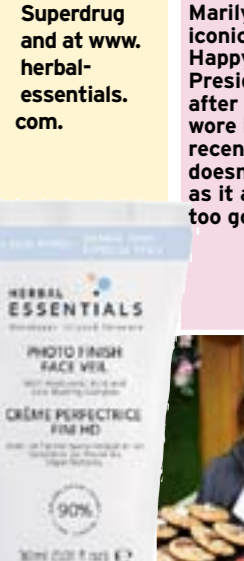
5. Photo Finish Face Veil, £15