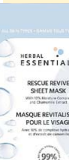
3. Herbal Essentials Rescue Revive Sheet Mask, £5