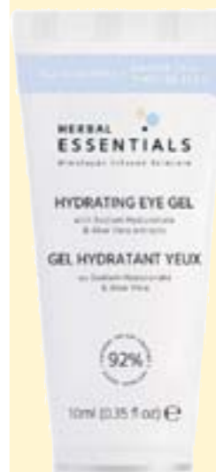
2. Herbal Essentials Hydrating Eye Gel, £12