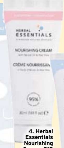
4. Herbal Essentials Nourishing Cream, £12